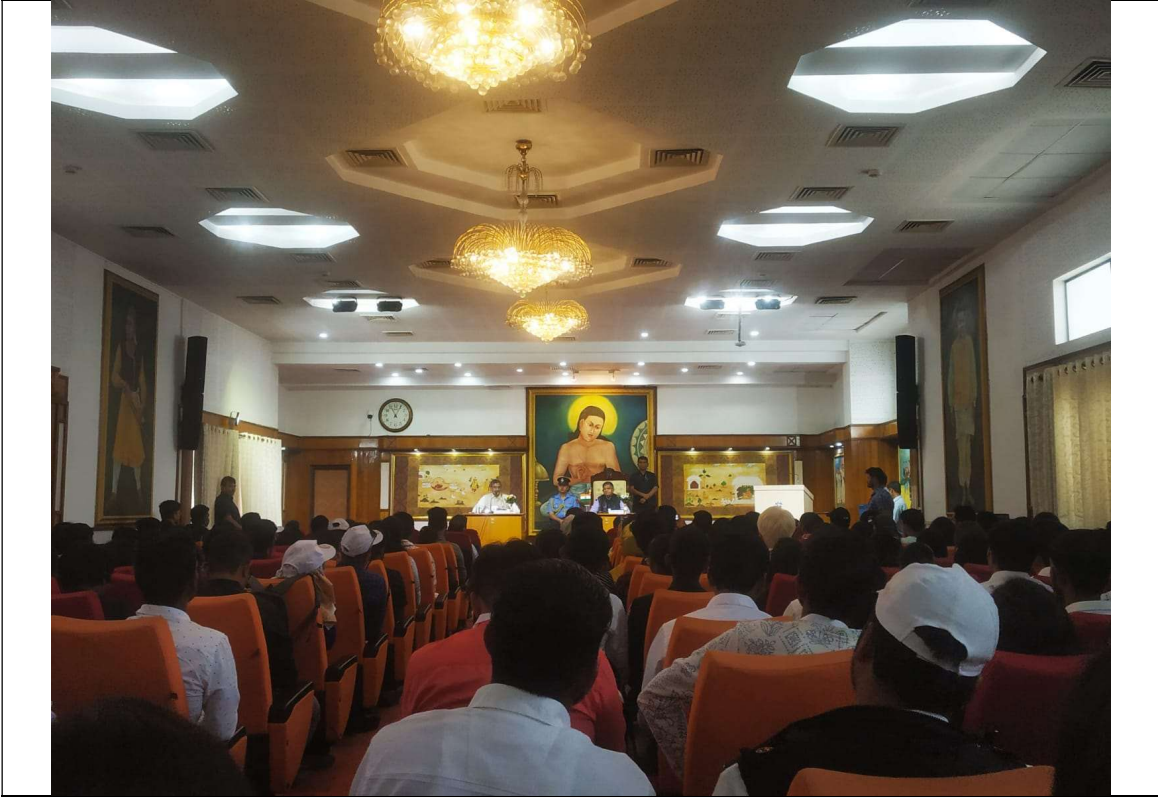
Hon'ble Governor of Assam Shri Gulab Chand Kataria addressing the gathering.