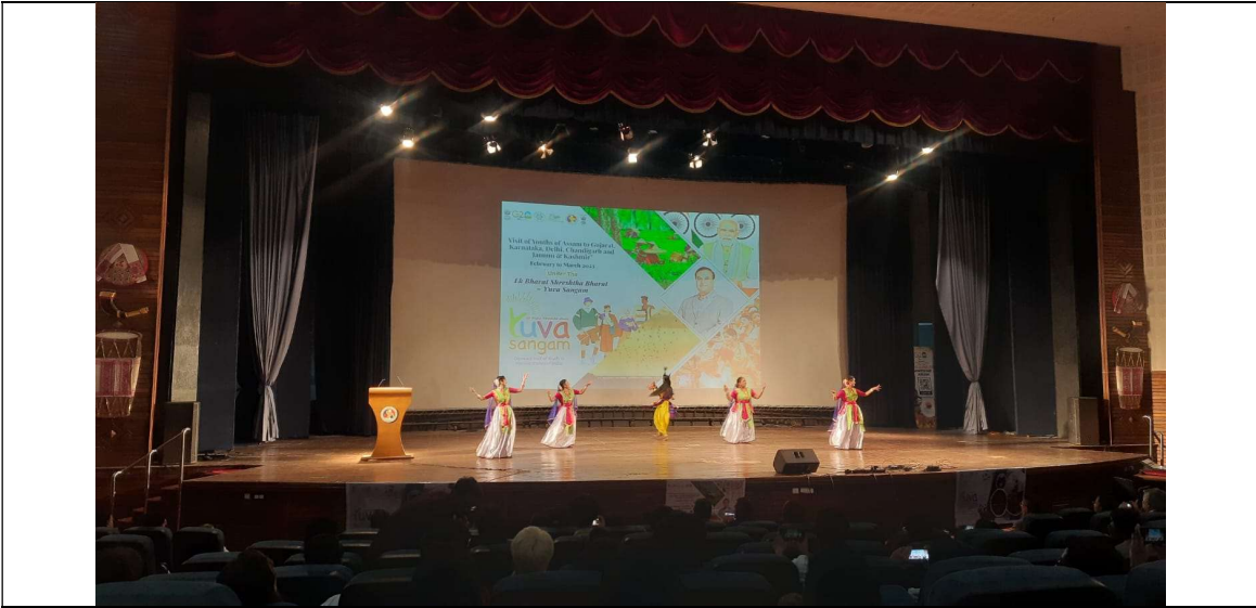
Students of Angavinoy performing folk dance.