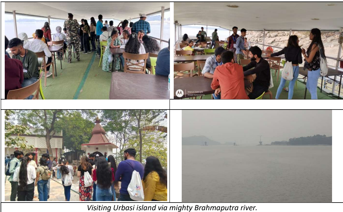
Visiting Urbasi island via mighty Brahmaputra river.

Participants visited Urbasi island in the morning. The travel was via water route across the mighty Brahmaputra, a unique experience in itself.