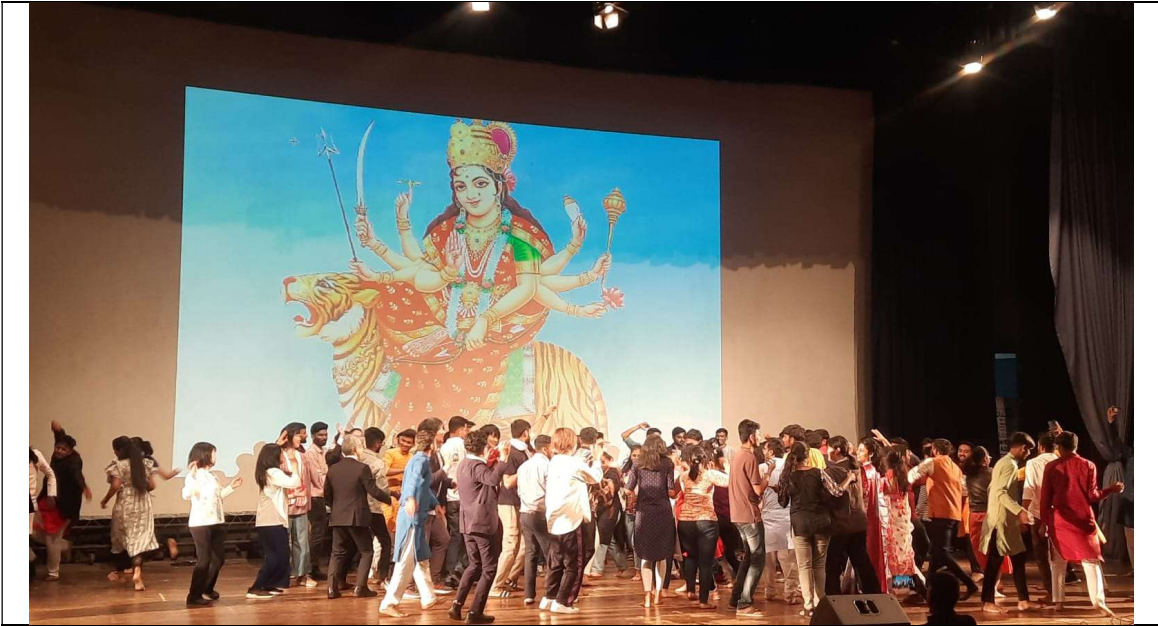
Participants on stage performing Garba a folk dance of Gujarat.