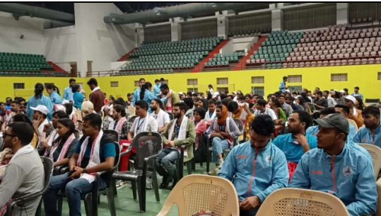
Interaction with the officials of LNIFE, Sonapur, Guwahati.