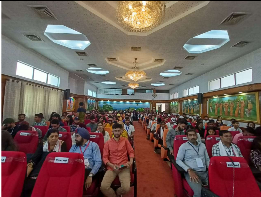
Participants at Raj Bhavan, Kharghuli Hill, Guwahati.