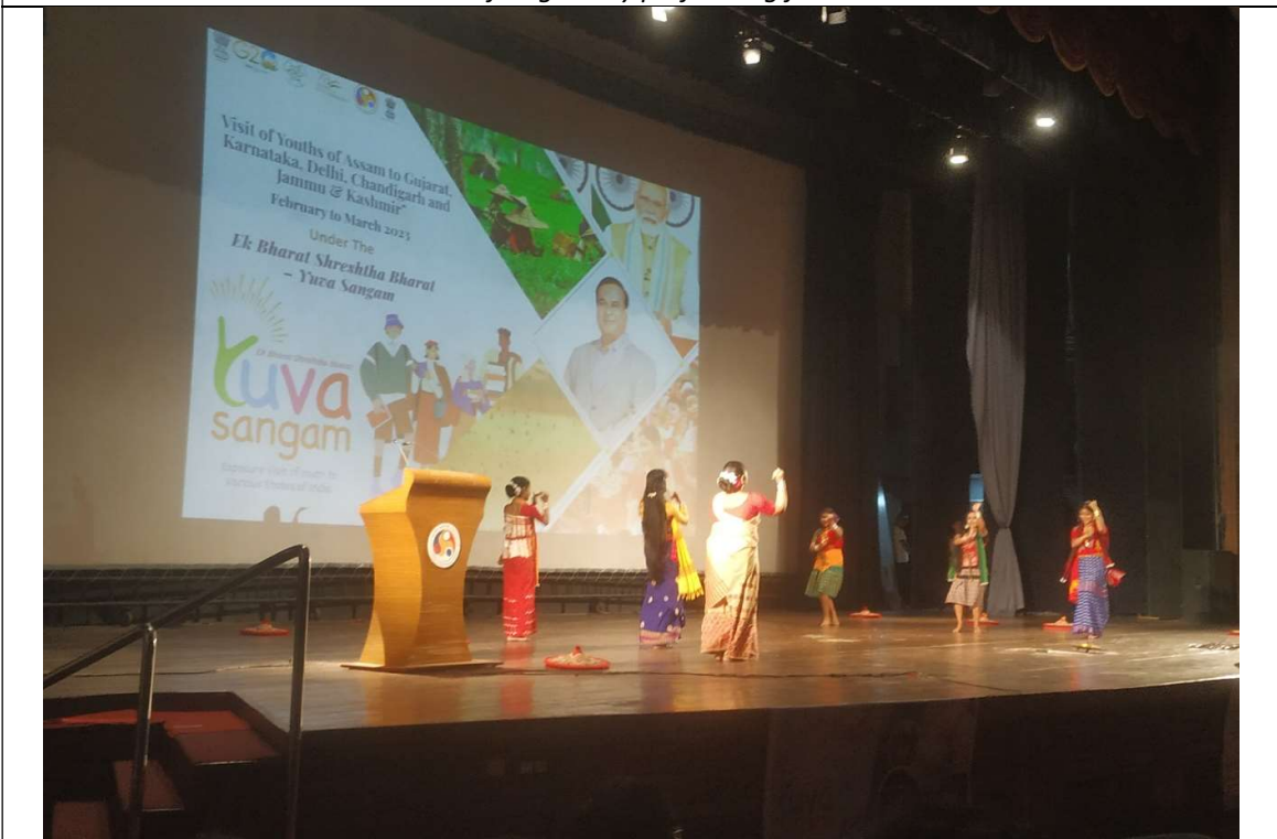
Students of Angavinoy performing folk dance.