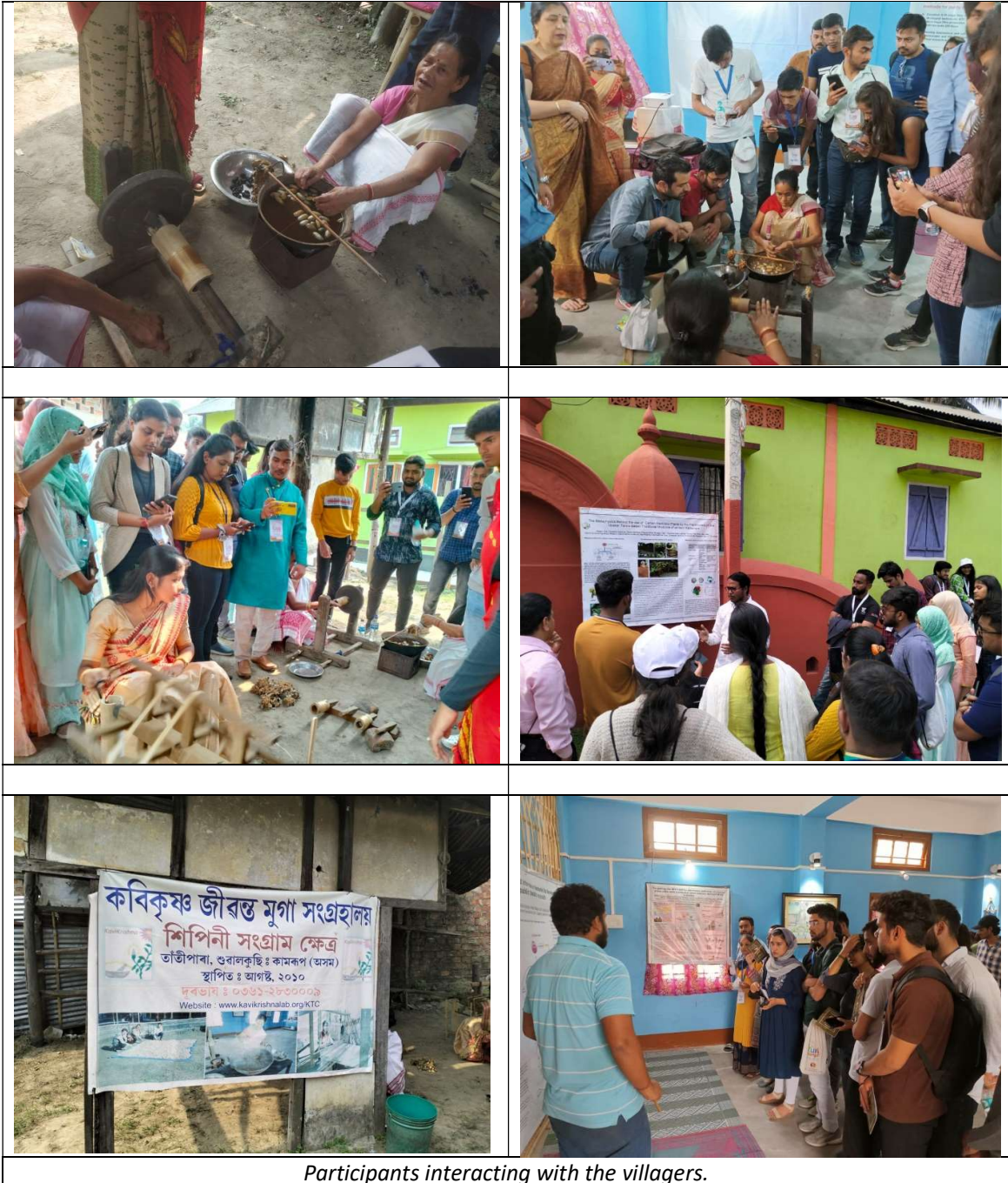
Participants interacting with the villagers.

The day ended with a cultural night where the students of Angavinoy Assam from Puranigudam, Nagaon performed traditional folk dances of Assam. Moreover, the participants represented their states and performed various events including traditional folk dance and songs.