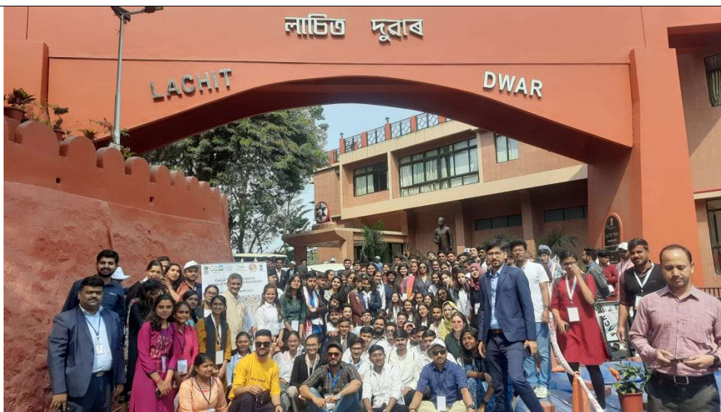
Participants at Raj Bhavan, Kharghuli Hills, Guwahati.