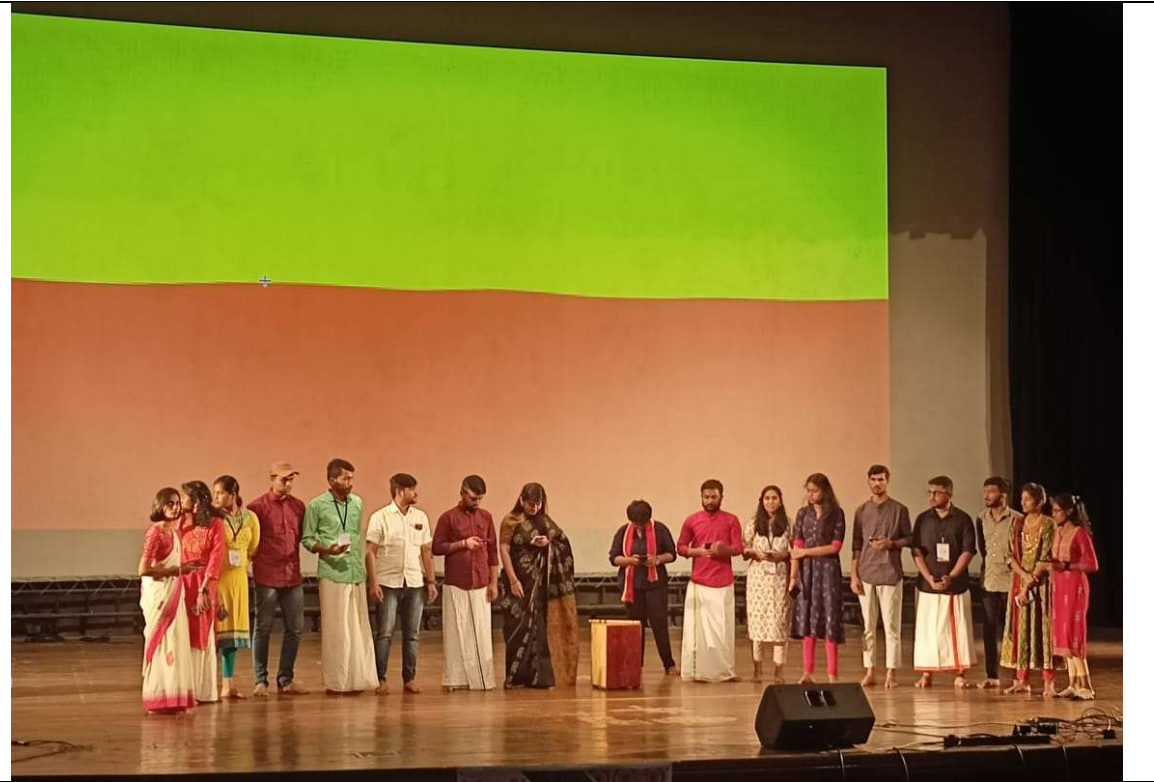
Students of Karnataka performing a group song.