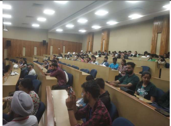
Participants attending the workshop.