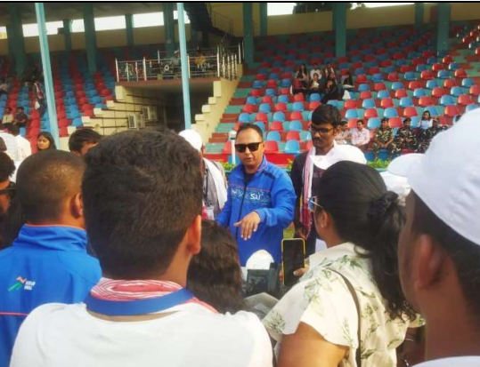
Interaction with the officials of the Sports Authority of India, Paltan Bazar, Guwahati