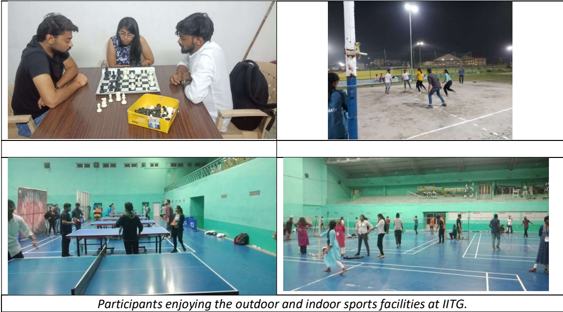
Participants enjoying the outdoor and indoor sports facilities at IITG.