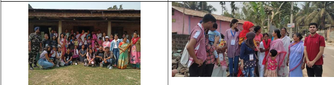
Participants interacting with the villagers under the buddy program.