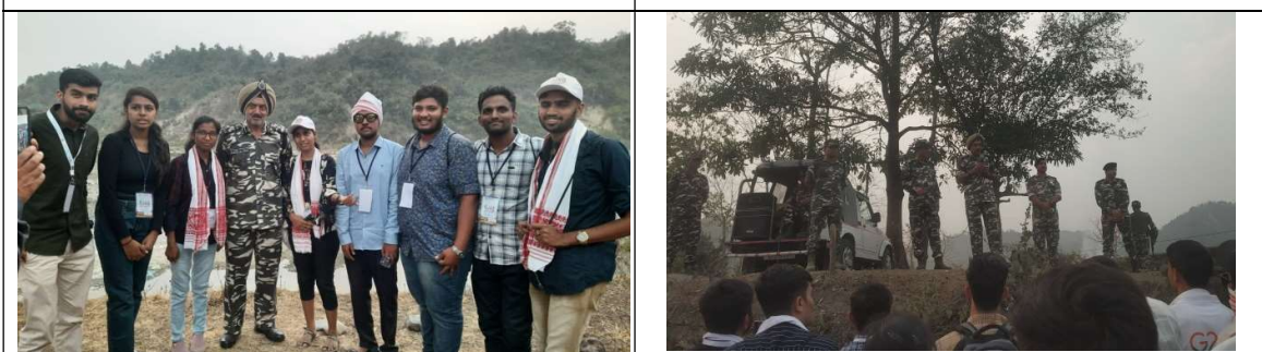
Bhutan border at Darranga.