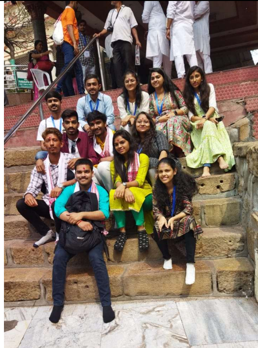
Participants at the Nilachal Hill visiting Kamakhya temple.