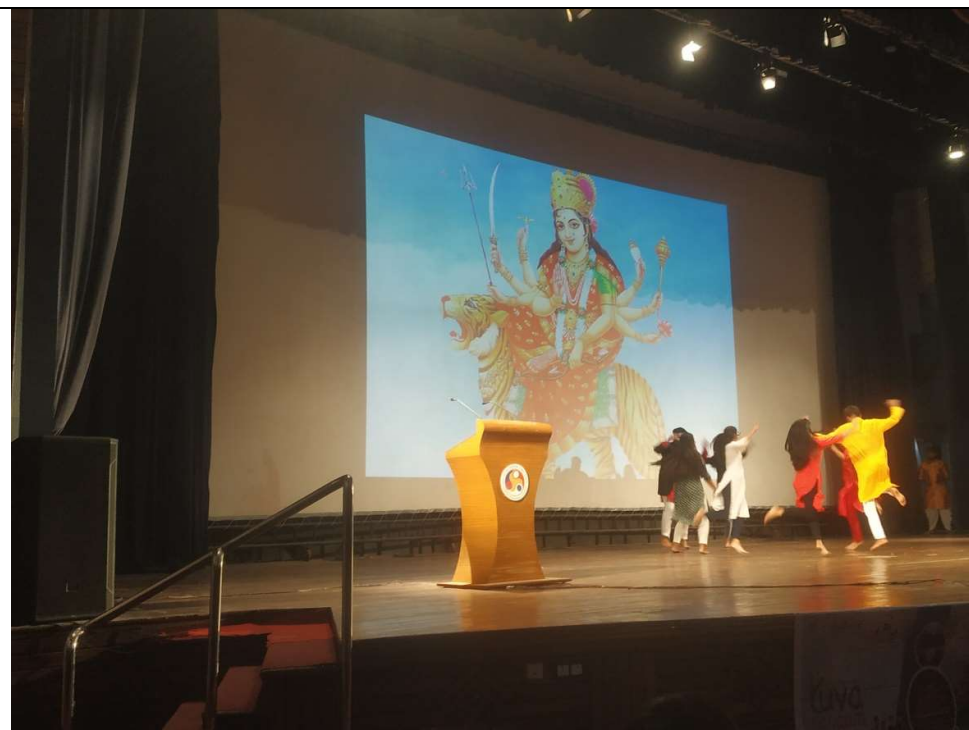
Students performing Garba a folk dance of Gujarat.