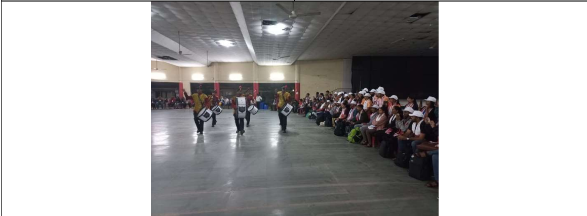
Sashastra Seema Bal performing in front of the participants.