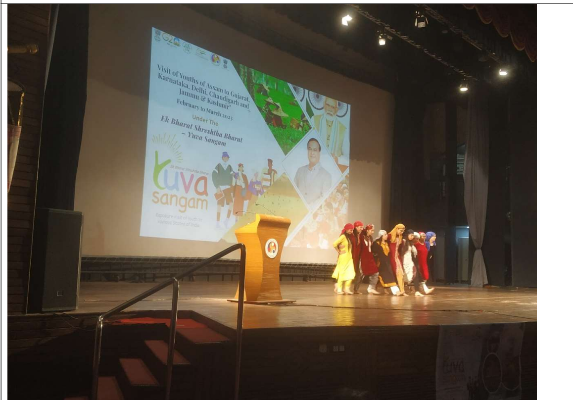
Students of Jammu & Kashmir presenting a folk dance.